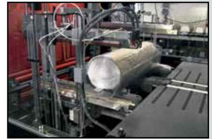
108-100 Side Seal Assembly for a Totally Enclosed Package

Complete Aftermarket Service & Support for Your Packaging Equipment