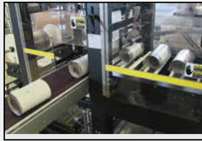
108-24 Overwrapping Station