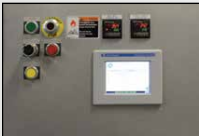
User-Friendly Operator Controls