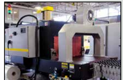
Single Zone Tunnel with Product Cooling Feature

Complete Aftermarket Service & Support for Your Packaging Equipment