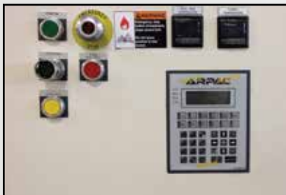
User-Friendly Operator Controls