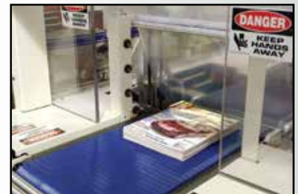
Automatic Product Height Detection for Random Sizes

Complete Aftermarket Service & Support for Your Packaging Equipment