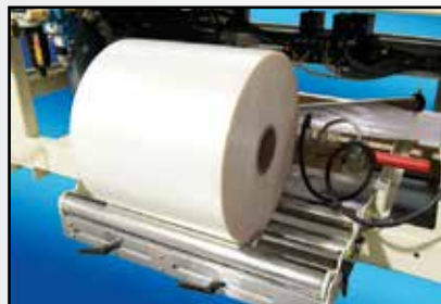
Side Mounted Film Cradles and Splice Bar for Quick and Easy Loading