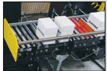
Smart Infeed Conveyor

Complete Aftermarket Service & Support for Your Packaging Equipment