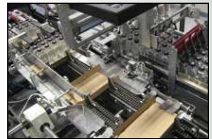
Product Loading Section

Complete Aftermarket Service & Support for Your Packaging Equipment