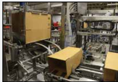
Case/Tray Forming Section