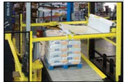
Optional Top Sheet Dispenser

Complete Aftermarket Service & Support for Your Packaging Equipment