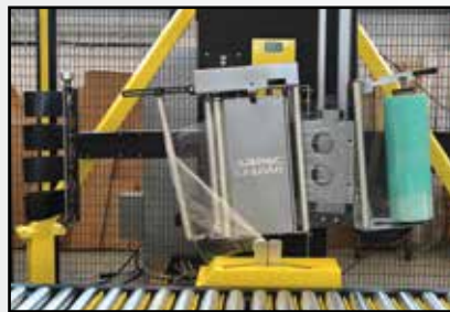
Electric Clamp, Cut, and Wipe Down System