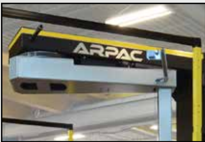
Heavy-Duty Slewing Bearing and NEMA 3R Commutator